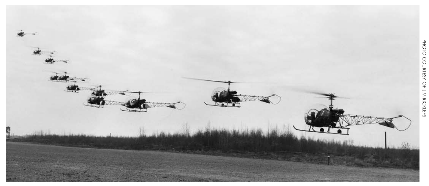
Rick Helicopters, Inc. and Alaska Helicopters, Inc. join in an eleven-helicopter formation in Anchorage, Alaska just before going out on an Army Map Service surveying contract.

Francisco installations for a real good profit.