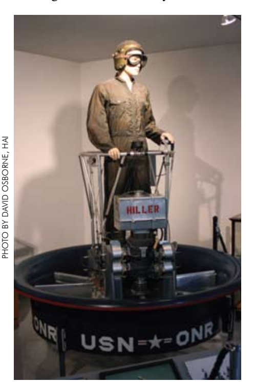
"Flying Platform" display at the Hiller Aviation Museum

ROTOR: The first Bell that you bought was priced at $25,000. What do you think about the prices of helicopters